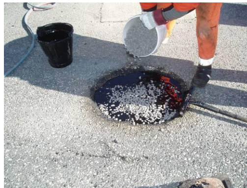
The area is filled with steel slag 11/16 mm