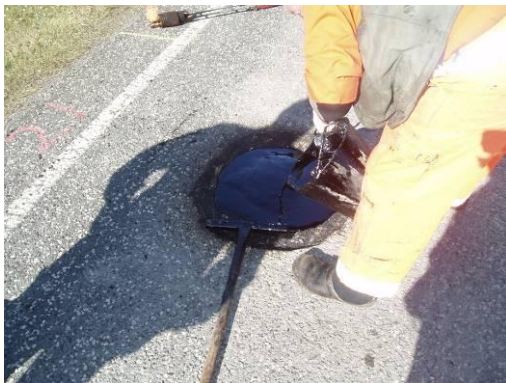
The sealer is poured into the area so only the bottom is covered