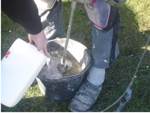
A stapling improver is added until a slurry consistency is achieved