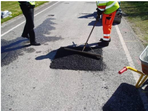
The mix is distributed in the area with a grater