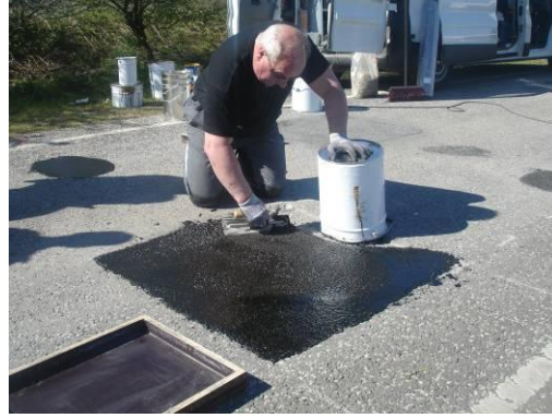
The mortar is distributed with a trowel