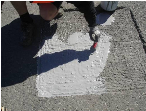
The mixture is distributed as a primer