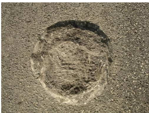
Area: 700 x 600 mm, depth 60 mm