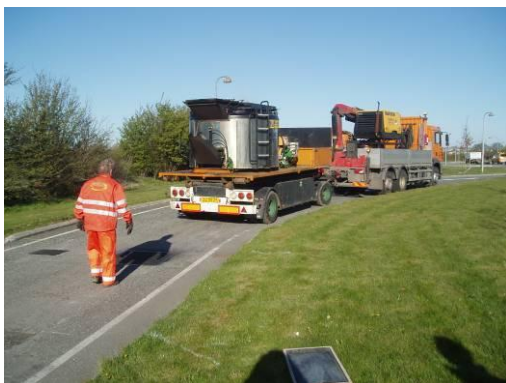
Heating Equipment for Mastic Asphalt