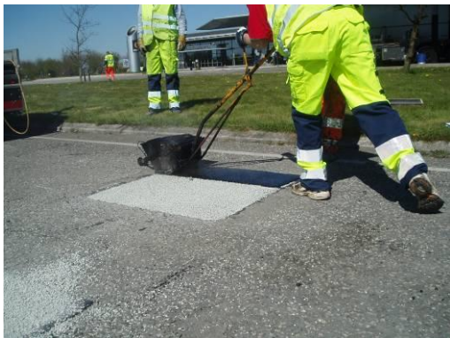
The sealant is applied in a thin layer over the aggregate