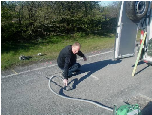
The area is cleaned by vacuuming