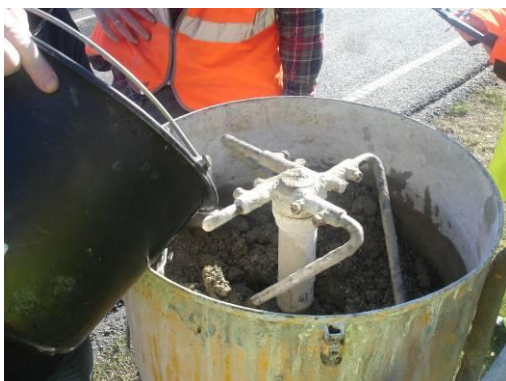
Water is added