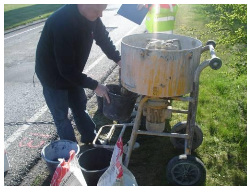
A part of the mix is tapped form the forced action mixer