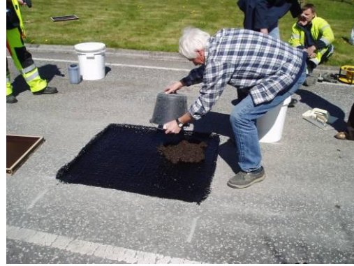
The mixture is poured into the primed area