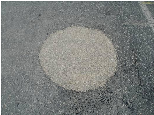
The completed repair