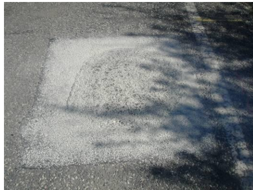
The completed repair