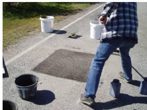
The surface is dusted with sand