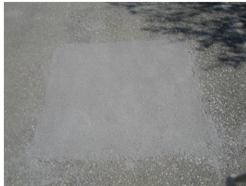
The completed repair