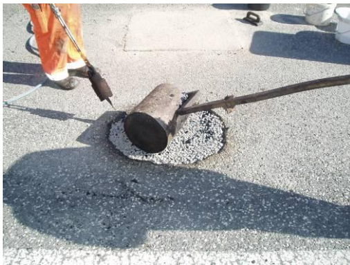
The area is compacted while the surface is heated with a jet blaster