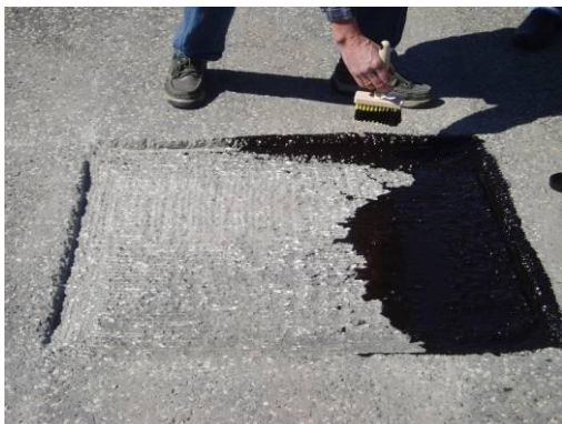
The emulsion is applied with a brush as a primer