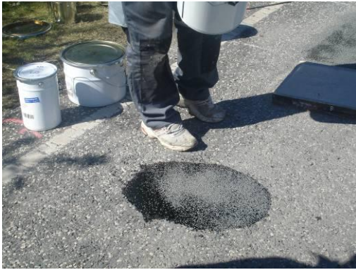
The surface is dusted with aggregate 1-3 mm