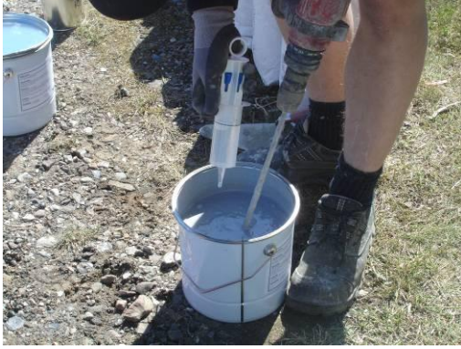
An accelerator is added