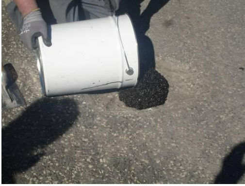
The mortar mixture is poured in to the area