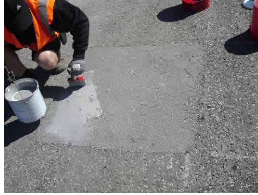
The surface is brushed with a binder mixture