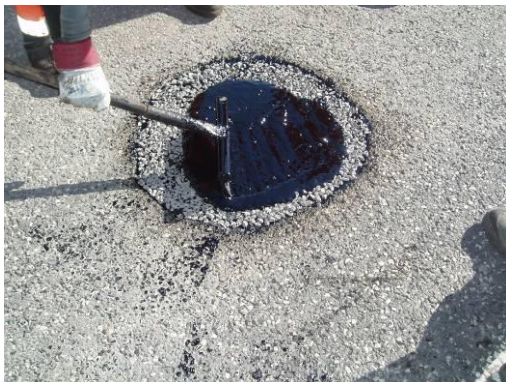
A third layer of sealant is distributed