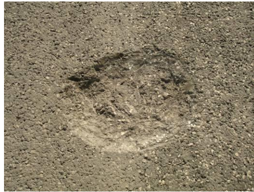
Area: 500 x 400 mm, depth 60 mm