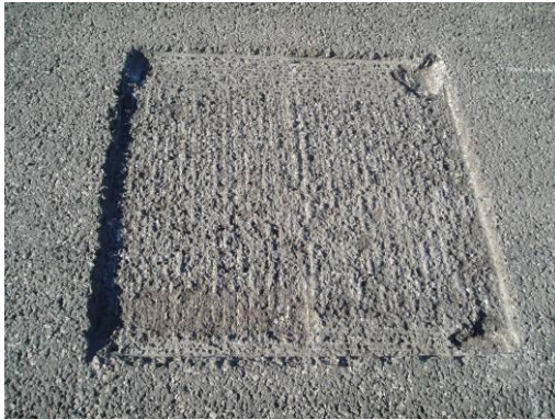
Area: 1 x 1 m, depth 25 mm