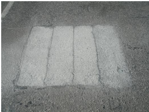
The completed repair