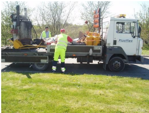
Equipment for heating device