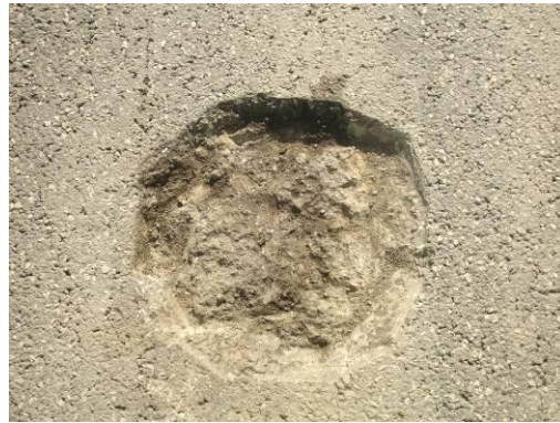
Area: 550 x 550 mm, depth 50 mm