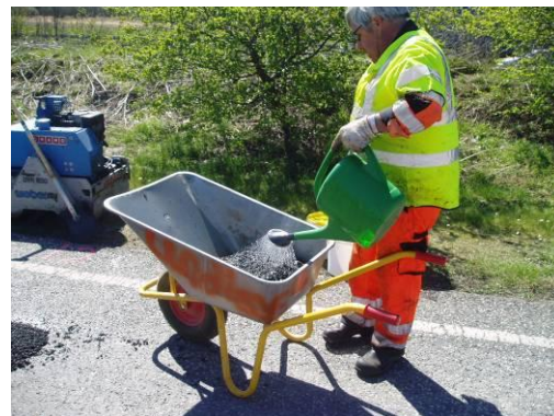
Water is applied to the mixture