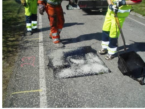
The surface is dusted with aggregate 2/5 mm