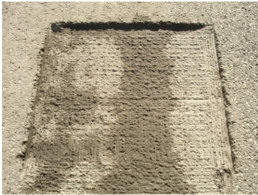
Area: 1 x 1 m, depth 25 mm