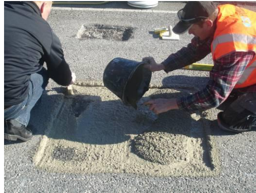
The cement mortar is poured in to the area