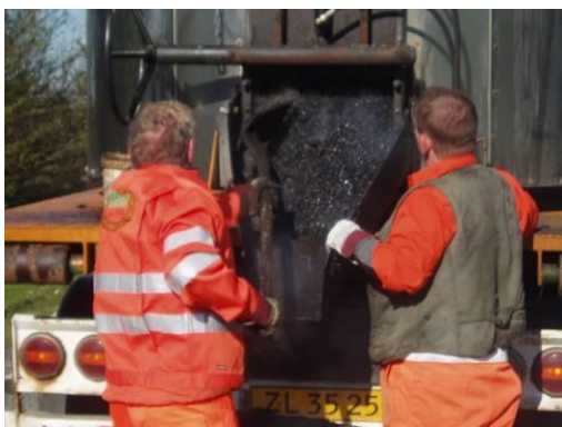
Mastic Asphalt is tapped from the kettle at 224 °C