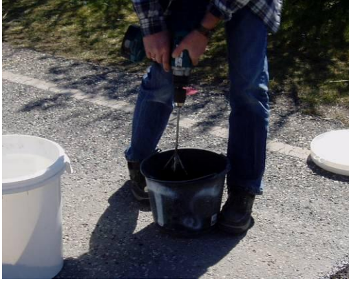
The mixture is stirred mechanically