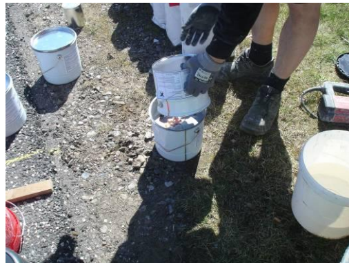
The two components of the synthetic binder are mixed