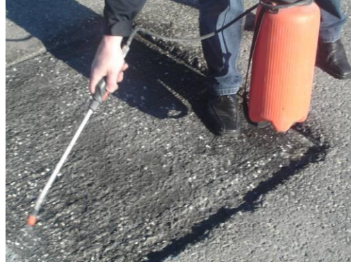
The area is sprayed with tap water