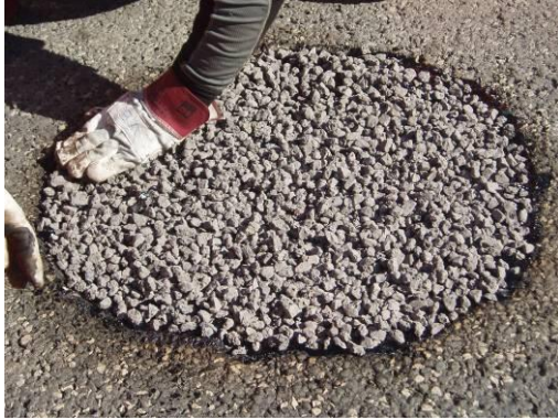
A second layer of steel slag 11/16 mm is added