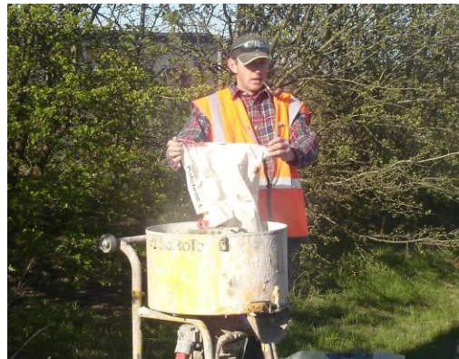
The dry parts are poured into a paddle mixer