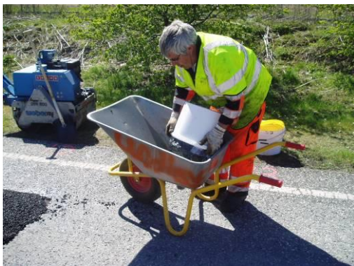
Asphalt mixture is poured into a wheelbarrow