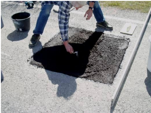
The mixture is distributed with a trowel