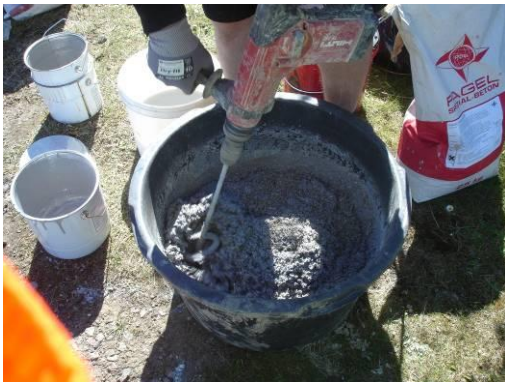
The mortar mixture is stirred mechanically