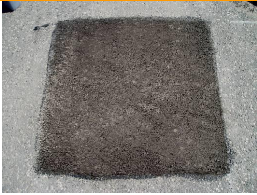
The completed repair