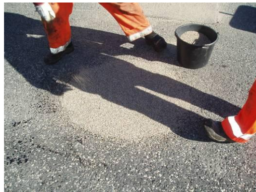
The surface is dusted with Quarts 2/3 mm