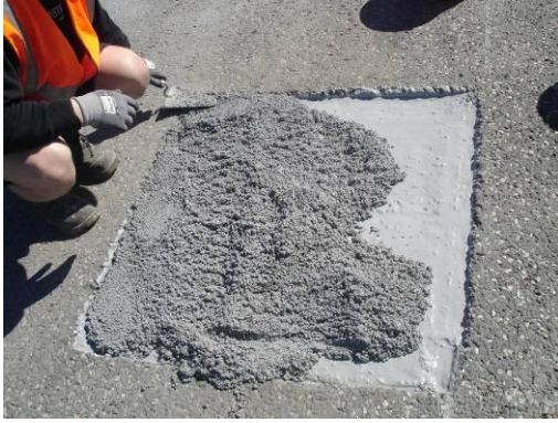
The mortar is distributed with a trowel