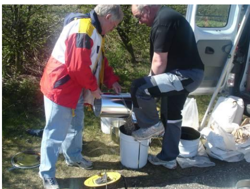
Aggregates are added the binder mixture