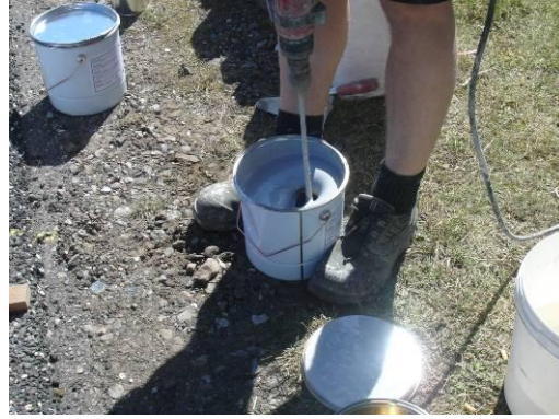
The mixture is stirred mechanically