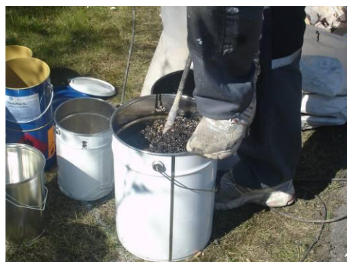
The mortar mixture is stirred mechanically