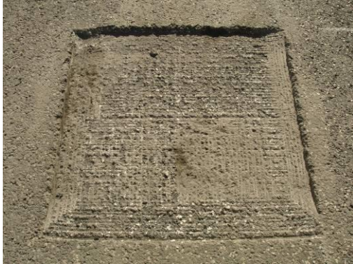
Area: 1 x 1 m, depth 25 mm