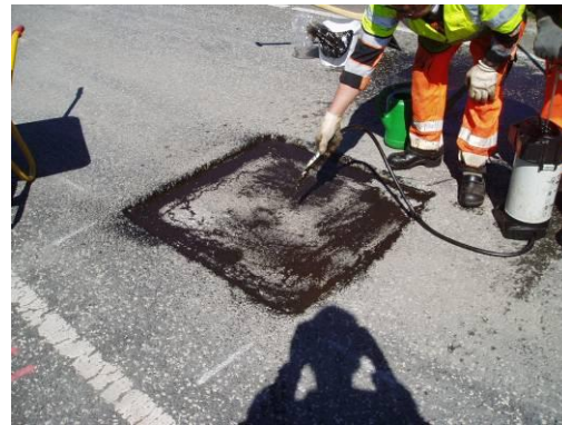
A primer is sprayed on the bottom and up along the edges