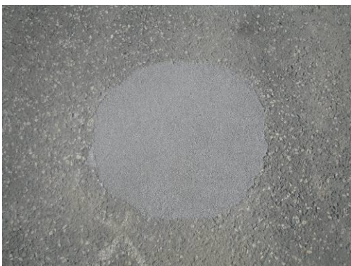
The completed repair