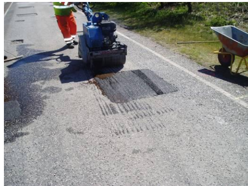
The area is compacted