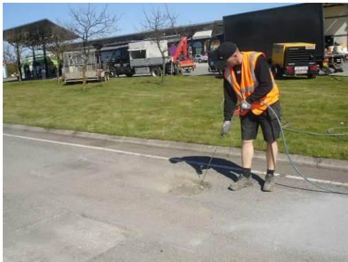
The area is cleaned with compressed air