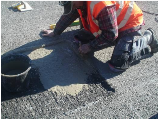
The slurry is distributed with a broom