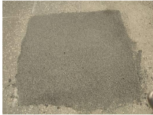
The completed repair