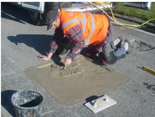
The cement mortar is distributed with a trowel