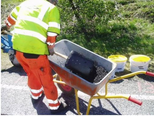
Asphalt and water are mixed with a shovel