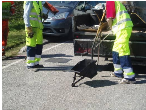
Special container for paving