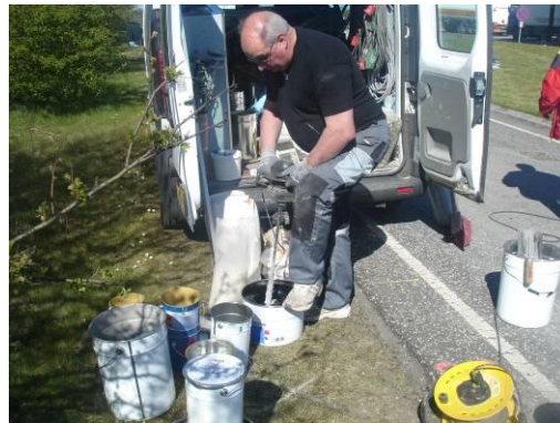
The mixture is stirred mechanically