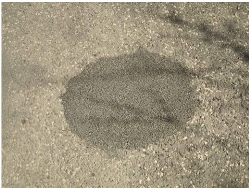
The completed repair