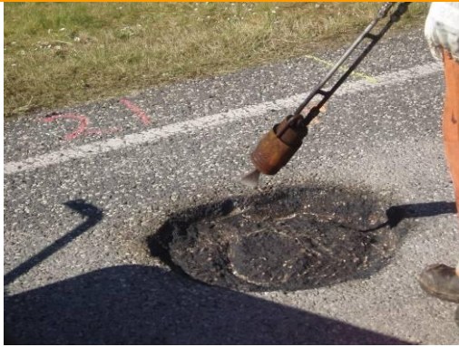
The area is heated with jet blaster