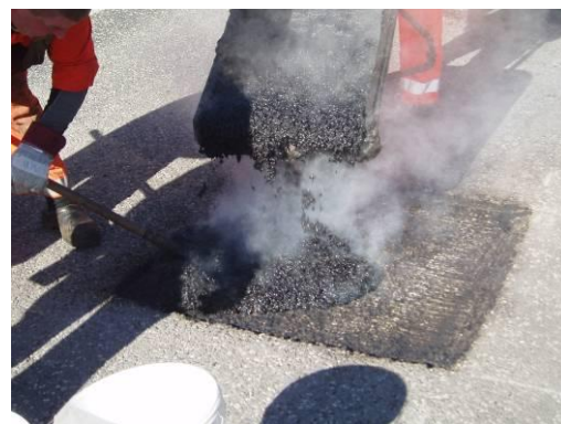
Mastic Asphalt is transferred to the area