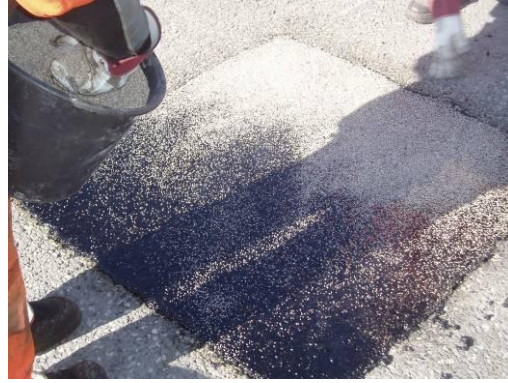
The surface is dusted with Quarts 1/2 mm