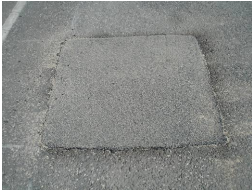
The completed repair