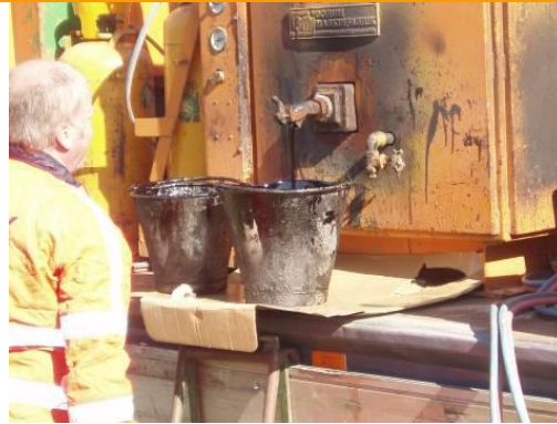
The sealer is tapped from the kettle at 140 °C