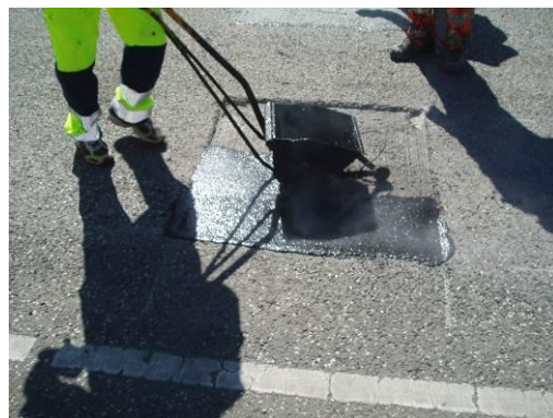
The area is filled with sealant.