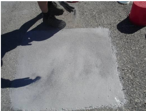
The surface is dusted with aggregate 0,5-1,0 mm