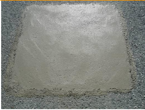
The completed repair