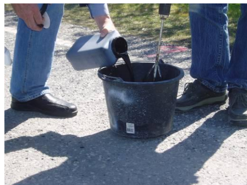
The emulsion is poured over the aggregate in the mixing container