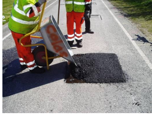
The asphalt/water mix is poured in to the area.