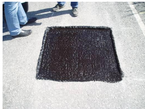
The primed area