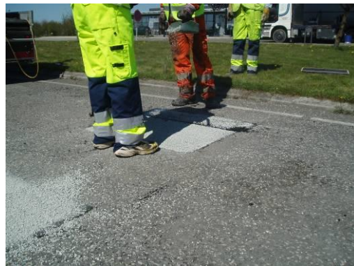
Each paving lane is dusted with aggregate 2/5 mm