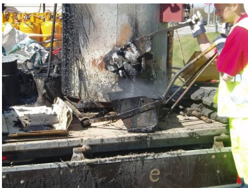
The sealer is tapped from the kettle at 220 °C