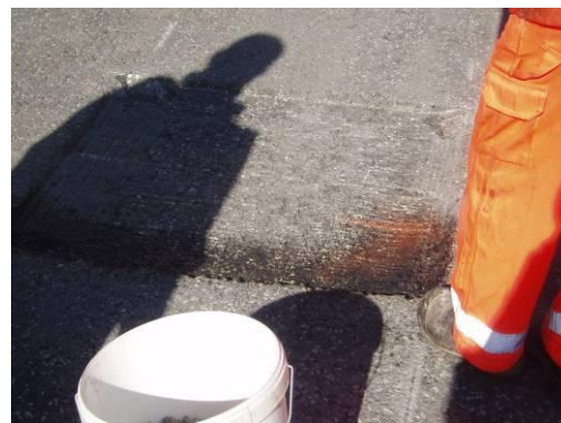
The area is heated with a jet blaster