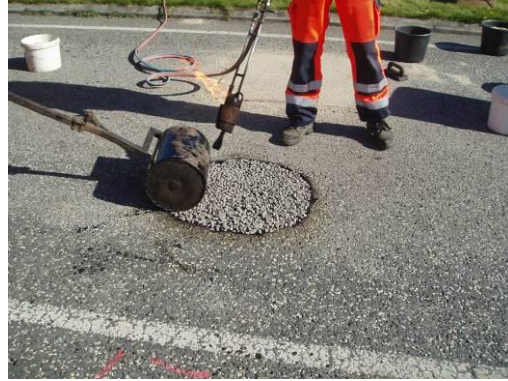
The area is compacted while the surface is heated with a jet blaster