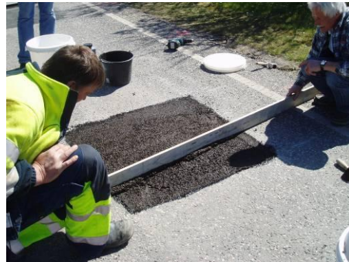
The material quantity is adjusted with a straightedge