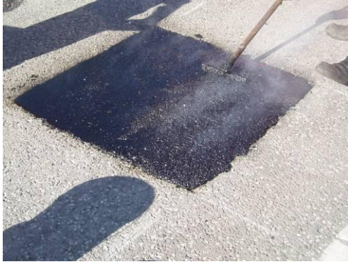
Mastic Asphalt is distributed in the area with a grater