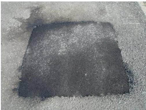
The completed repair