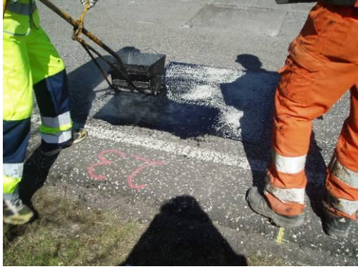
The sealant is laid out side the edge of the area