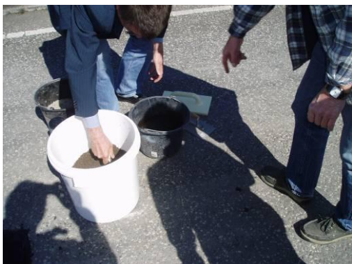
Aggregate 0/5 mm is transferred to a mixing container