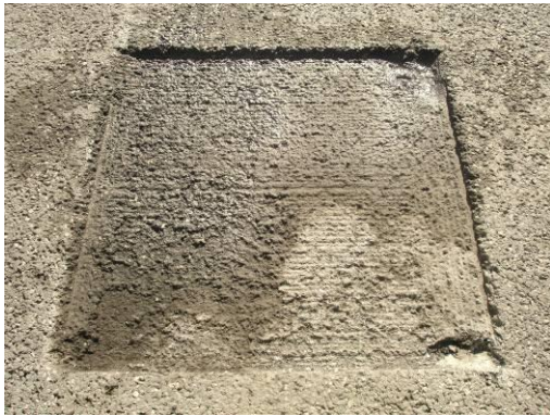
Area: 1 x 1 m, depth 25 mm