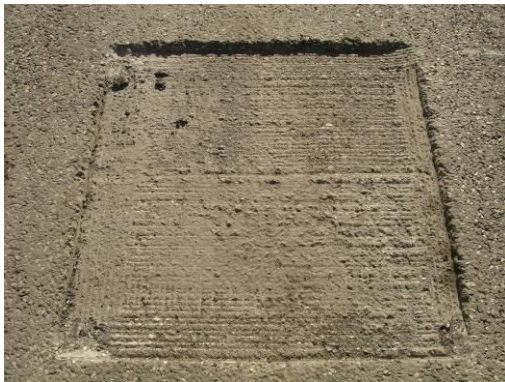
Area: 1 x 1 m, depth 25 mm