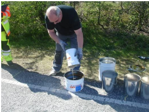
The two components of the synthetic binder are mixed