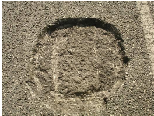
Area: 700 x 700 mm, depth 45 mm