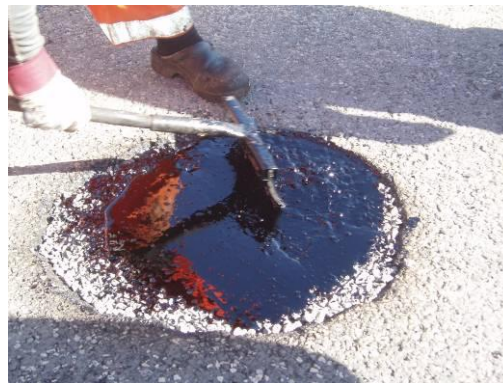
A new layer of sealer is poured over the steel slag