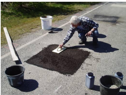
The surface is leveled