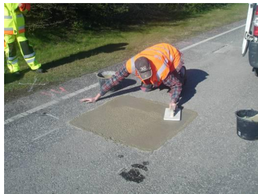
The surface is trimmed