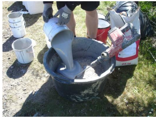
The mixture is poured over the aggregate