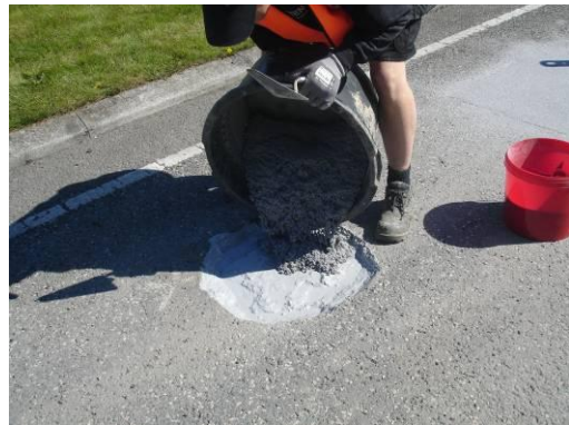
The mortar mixture is poured into the primed area